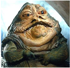
lose weight (a)

5. Ecris les conseils à donner à ces personnages en utilisant les indications données sous les images.